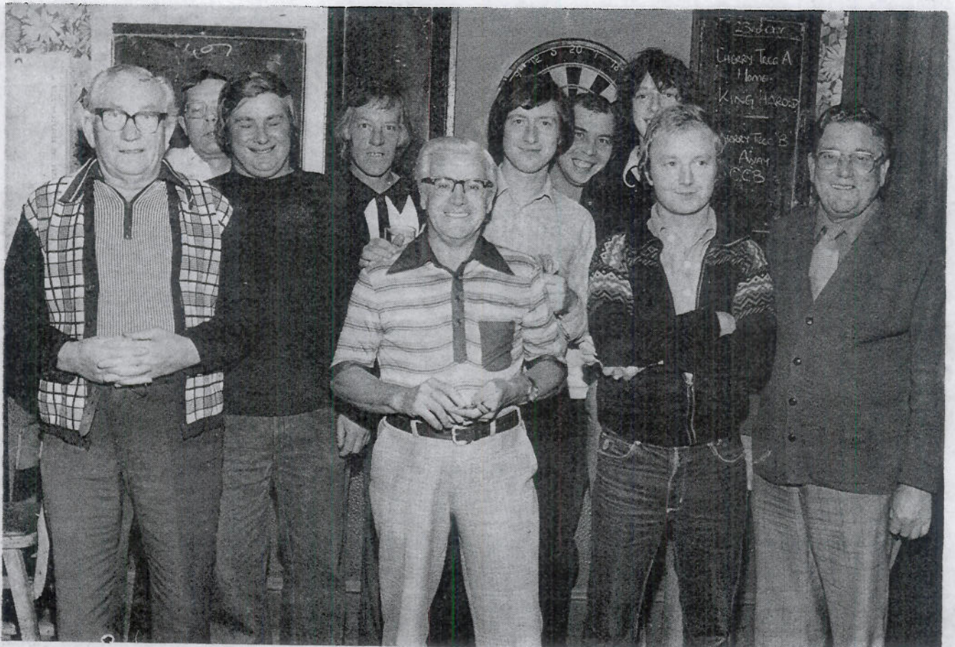
The King Harold team