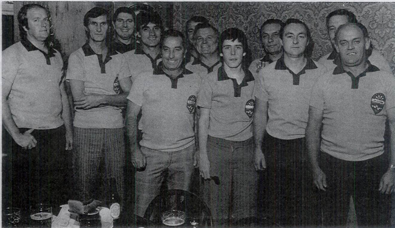
THE ALEX STALWARTS

THERE has been a darts team at the Alexandra since 1932, so it's not surprising that the Warley Hill pub has become the hotbed of darts for the Ind Coope League.