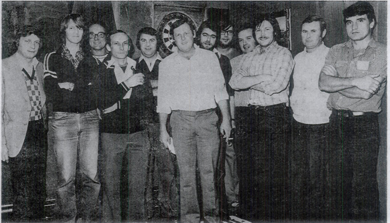
The Brentwood Super League team