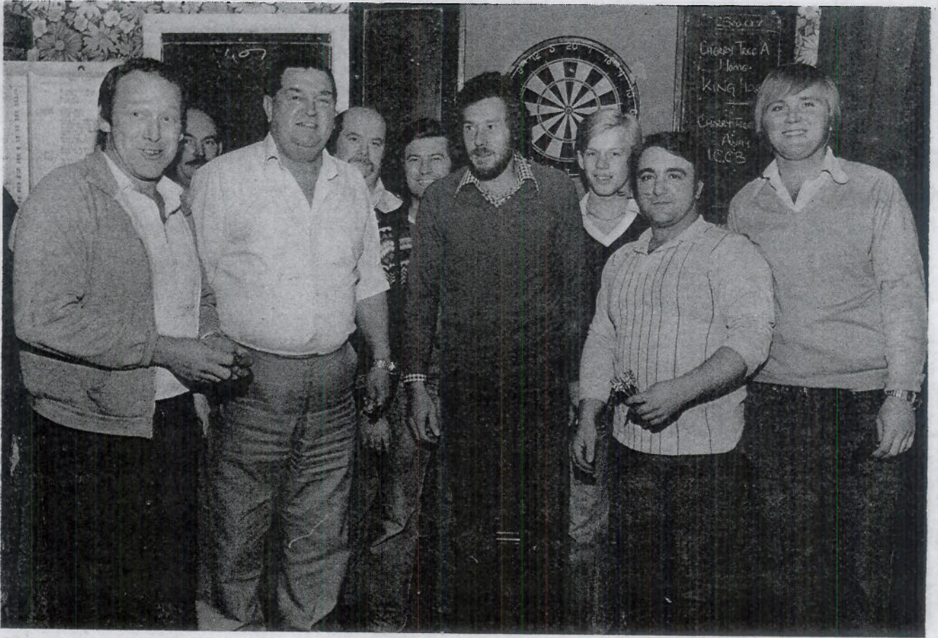
Cherry Tree players line up for our cameraman